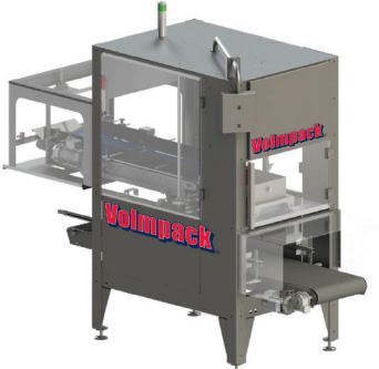
BD606 -15 CASE PACKER