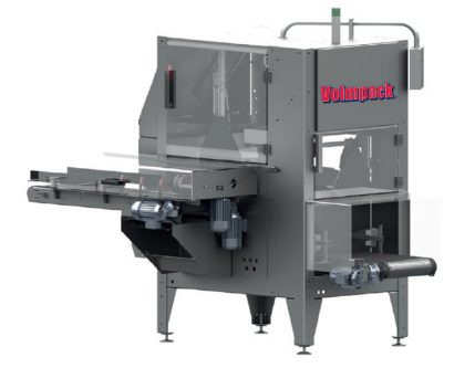
PDS90 CASE PACKER