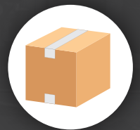
TOP & BOTTOM SEAL